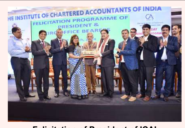
Felicitation of President of ICAI